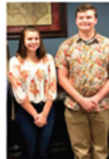
Youth Scholarship Awardees 2018 College Scholarship Winners